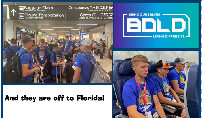
And they are off to Florida!

Operation Christmas Child Shoebox Work Day was held on July 15th. Their next gathering will be on Saturday, August 19th from 9am— noon. Come and go as needed. All are welcome.