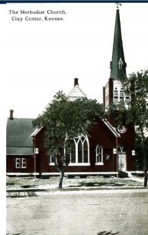
The Methodist Church, Clay Center, Kansas.

The cornerstone for the original Methodist Church was laid in September 1883 and construction was in progress until March 1885. The dimensions of the building were 90' x 110' with the bell tower rising 106' above the sidewalk. The dedication ceremony was held on March 8, 1885.